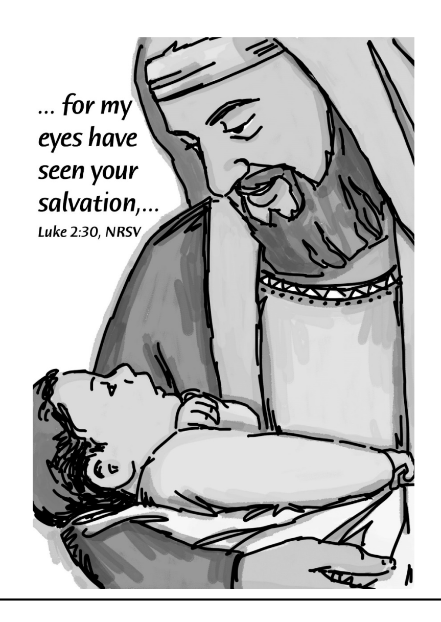
Sunday, December 31, 2023 1st Sunday after Christmas / New Year's Eve